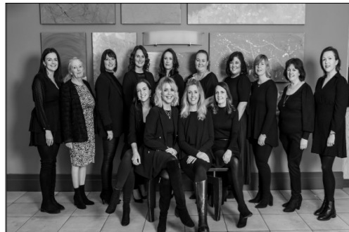
Crinniú will perform Carols by Candlelight Friday 9th December at 8pm

Recessional Hymn When creation was begun, God had chosen you to be, Mother of his blessed son, Holy Mary full of grace. Ave, Ave, Ave Maria. When Creation was restored You were there beside the Lord Whom you cherished and adored Holy Mary full of grace. Ave, Ave, Ave Maria. Lead us to your child above He will teach us how to love How to pity and forgive Holy Mary full of grace. Ave, Ave, Ave Maria.